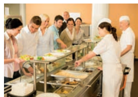
Traditional restaurant dessert